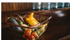
Force & Motion