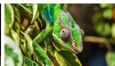
Interaction of Organisms

Students analyze and interpret data, develop models, construct arguments, and demonstrate a deeper understanding of the cycling of matter, the flow of energy, and resources in ecosystems. They are able to study patterns of interactions among organisms within an ecosystem. They consider biotic and abiotic factors in an ecosystem and the effects these factors have on populations. They also understand that the limits of resources influence the growth of organisms and populations, which may result in competition for those limited resources. The crosscutting concepts of matter and energy, systems and system models, patterns, and cause and effect